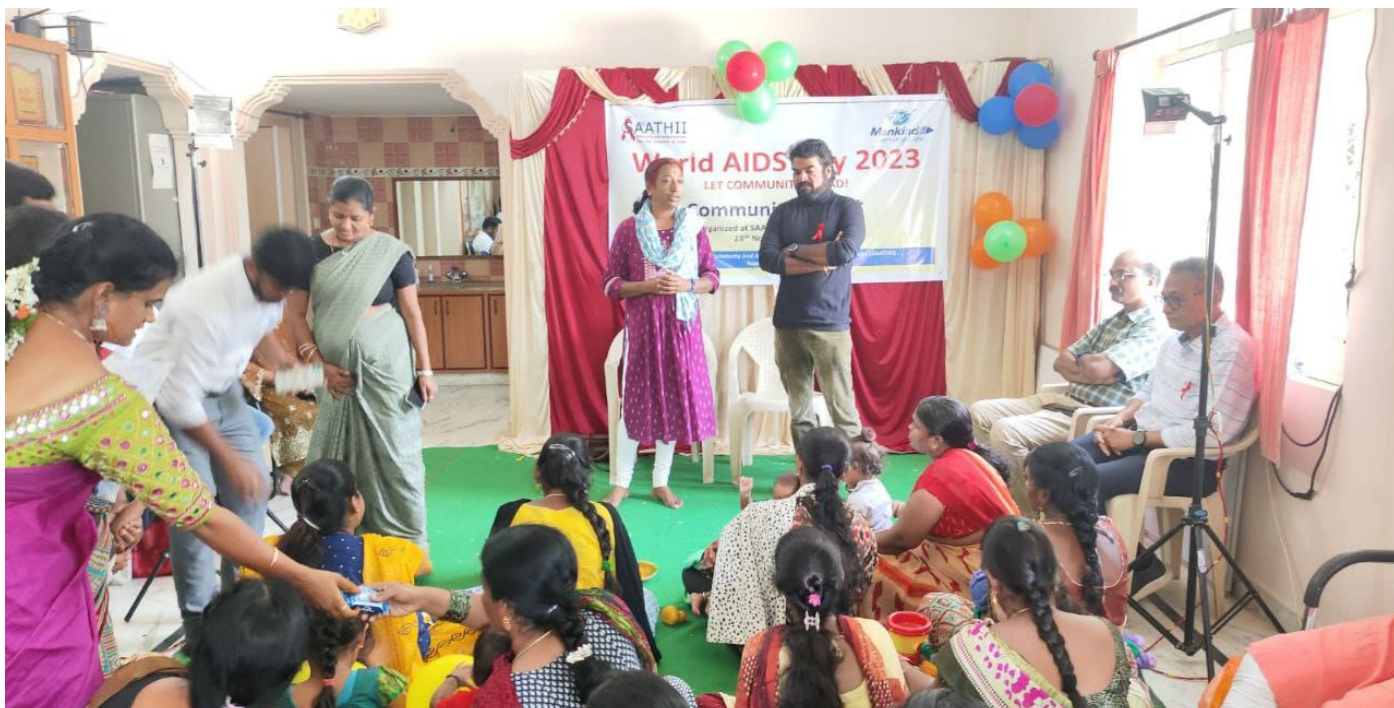
World AIDS Day program, 2023