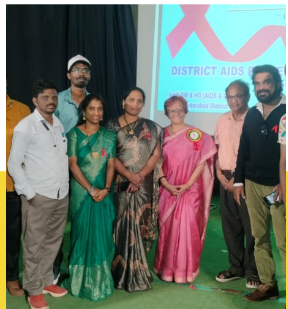
World AIDS Day program at District level