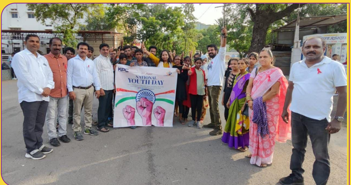
National Youth Day celebration