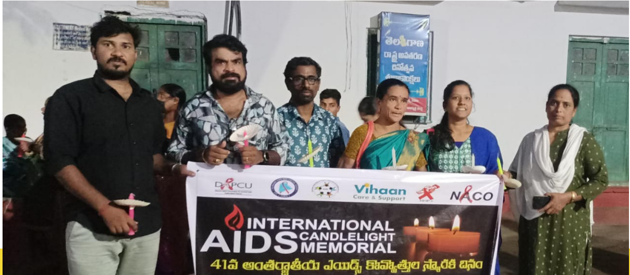
: International AIDS Candlelight Memorial day