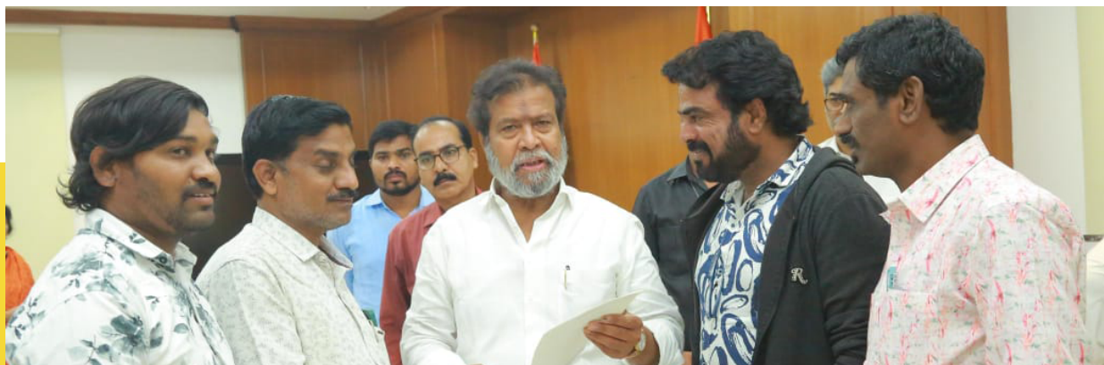
Advocacy with the Health Minister of Telangana

PLHIV self-help groups (SHGs) sustained, thereby economically empowering 180 WLHIV