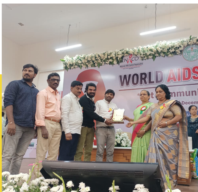
World AIDS Day program at State level

Over the past 2 decades, HOPES has successfully worked towards developing an enabling environment for the PLHIV community through a collaborative approach that brought together the varied stakeholders in the district - the community, the govt. and the civil society.