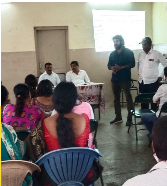
World AIDS Day program at District level