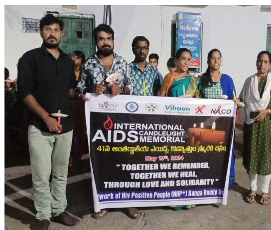
International AIDS Candlelight Memorial day