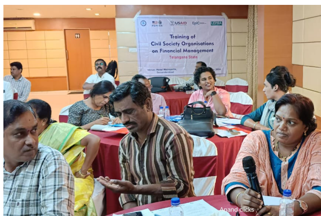
HOPES staff participates in Finance Management Workshop, organized under EpiC