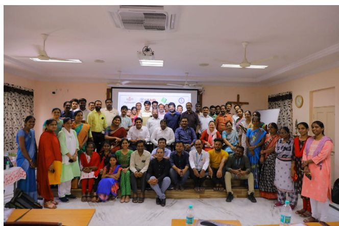
HOPES staff participates in CBO strengthening workshop, organized under EpiC project by FHI360 and Lepra Society

A Capacity Development Plan (CDP), prioritized by a participatory process, shall be made in consultation with the EpiC team. The identified priority areas shall be strengthened through workshops and mentoring visits conducted by the EpiC team.