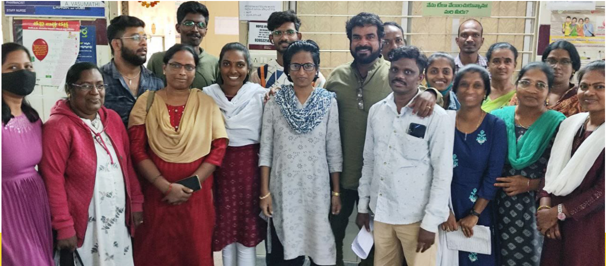
Review meeting at District AIDS Prevention & Control Unit (DAPCU)