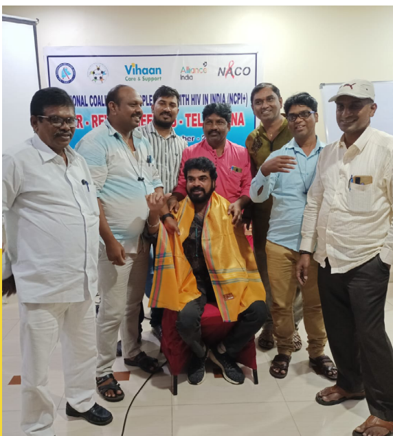
Secretary of HOPES felicitated by his peers