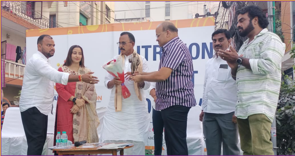
Nutrition distribution for PLHIV, supported by KC Pullaiah Foundation