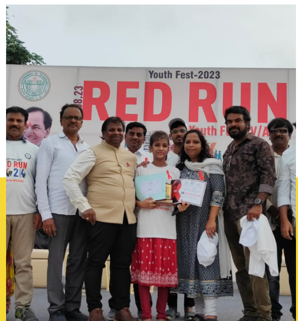
HOPES staff participates in Youth Fest Red Run 10K program